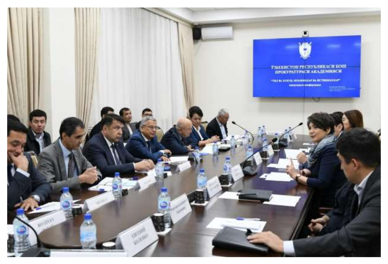
16.3.3 - Does your university as a body undertake policy-focused research in collaboration with government departments?

For a long time, the scientific department of Samarkand State University has been responsible for evaluating, assessing, and facilitating the research activities at the university. For conducting scientific research, the university provides a healthy and equitable environment for our researchers to be more focused on policy-focused research.