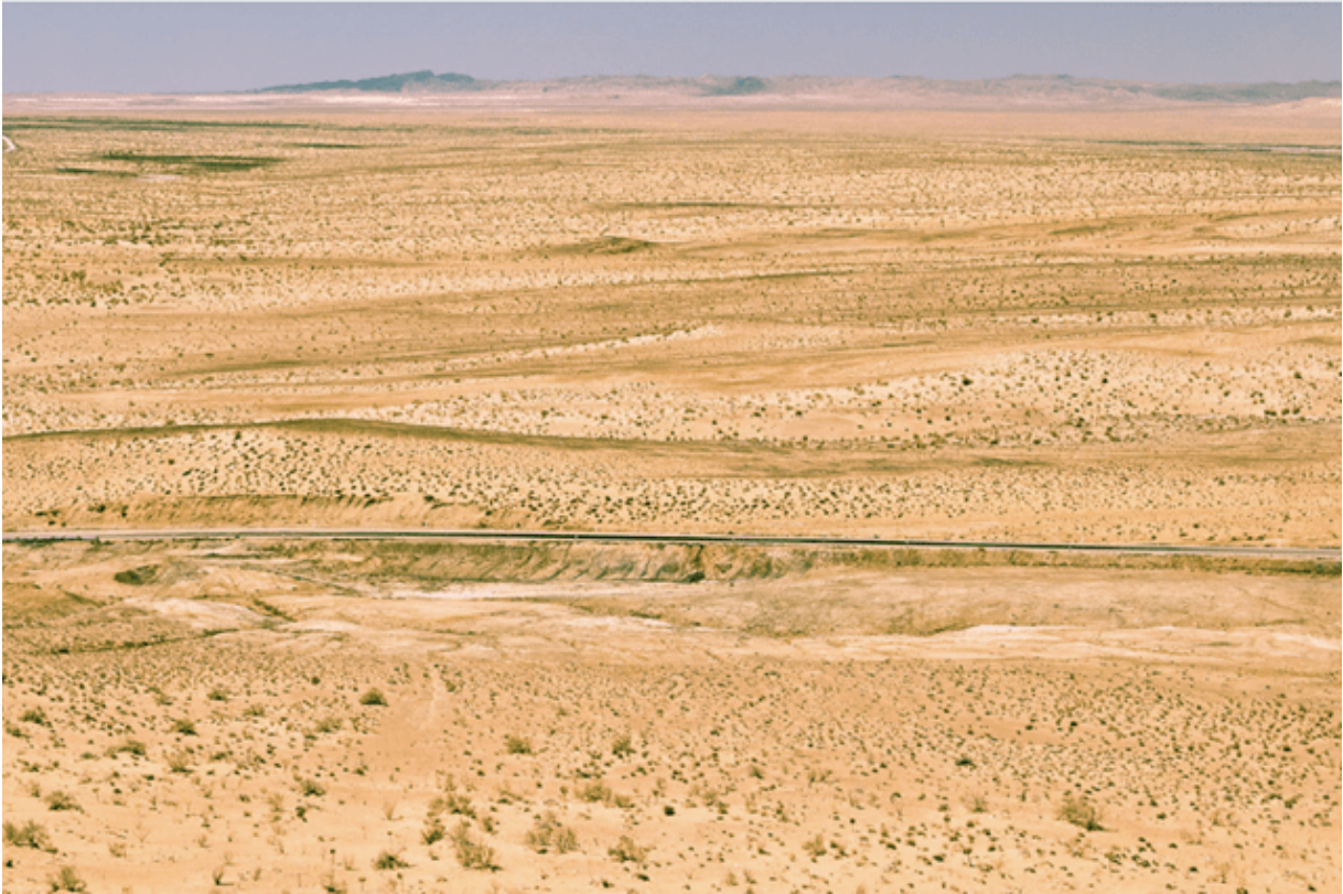
The Kyzyl-Kum desert.