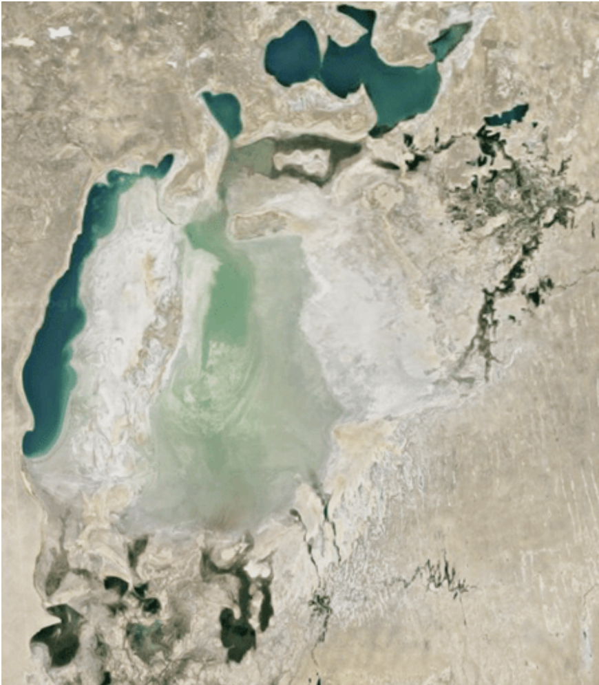
Aral Sea image-2020.