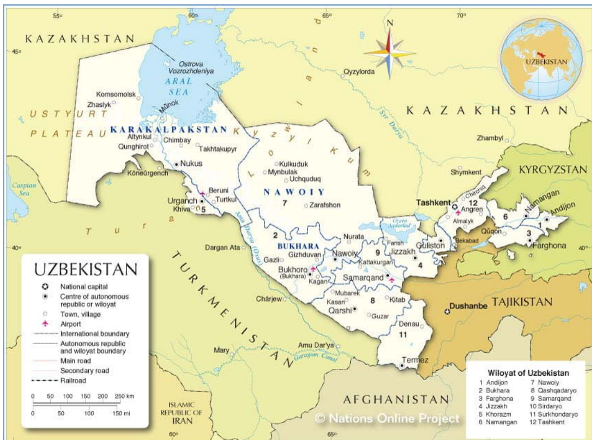
Regions of Uzbekistan

In Uzbekistan’s deserts and steppes, the rainfall is modest, ranging between 100 and 200 millimeters per year. In such areas, precipitation mainly occurs during the cold period of the year (September–March), while the warm period (April–August) is extremely arid. In the foothills, on the other hand, precipitation ranges from 300 to 400 millimeters per year, increasing to about 600 to 800 millimeters per year on the west and southwest slopes of mountain ridges. Observed changes in precipitation regimes show an increase in the number of days with precipitation of more than 10 millimeters in plain and foothill territories. At the same time, a relatively small (about 9 percent) increase in the number of days with precipitation of more than 20 millimeters was observed in mountainous areas.