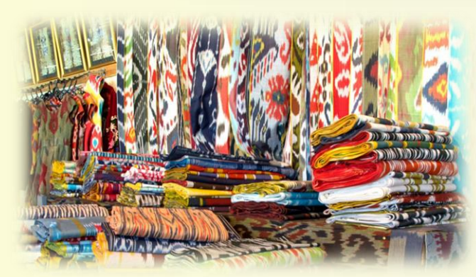
National silk clothes