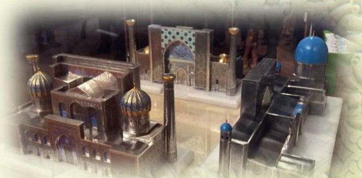
Model of Registan Square (Samarkand) placed at United Nations in New York